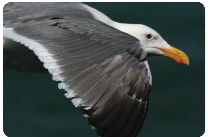
Western gull, courtesy of Alan Schmierer

HOW MANY FEATHERS ON A BIRD? There are about 1,000 feathers on a hummingbird and about 25,000 feathers on a swan