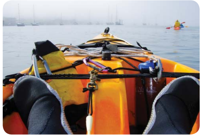
Kayaking