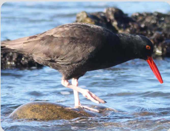
Black Oystercatcher