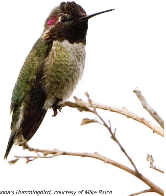
Anna's Hummingbird