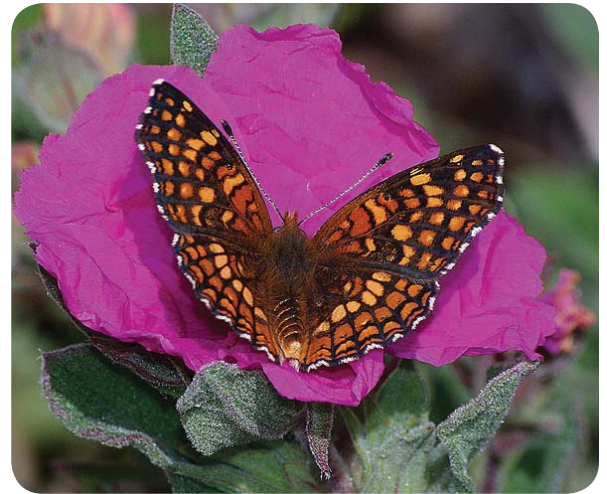
Gabb's checkerspot