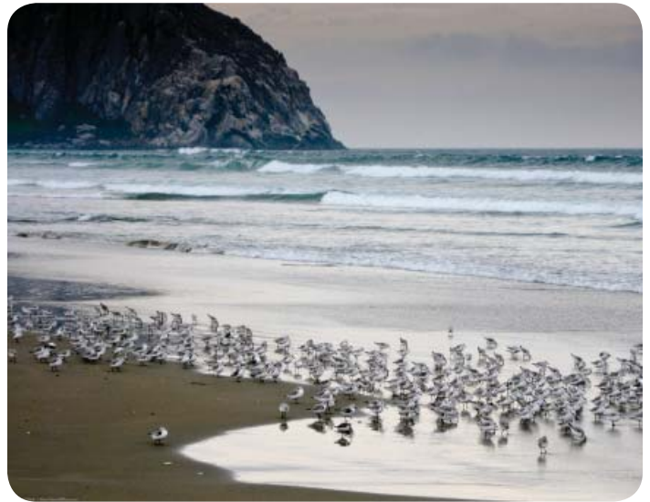
Morro Strand

Yes! I want to become a Business Member of Morro Coast Audubon Society