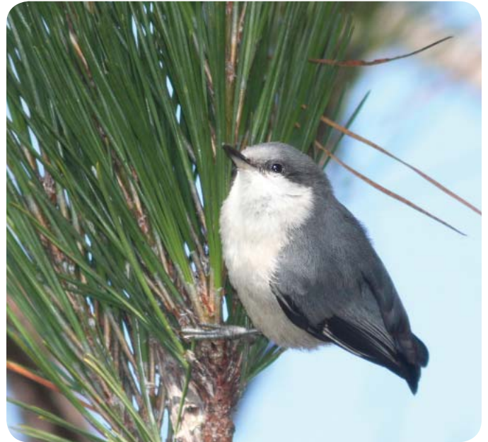
Nuthatch