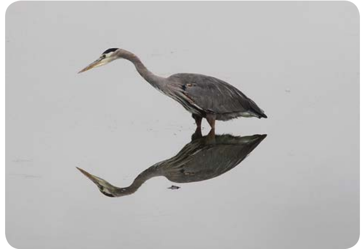
Great Blue Heron

All of these wonderful showers have definitely brought us flowers, but some of them happen to be weeds. Come enjoy the splendor of spring at the preserve and give the native flowers a helping hand by removing pushy weeds. Meet at the main entrance off Ramona. Tools, tips and munchies will be provided. Bring gloves if you have them and dress in layers.