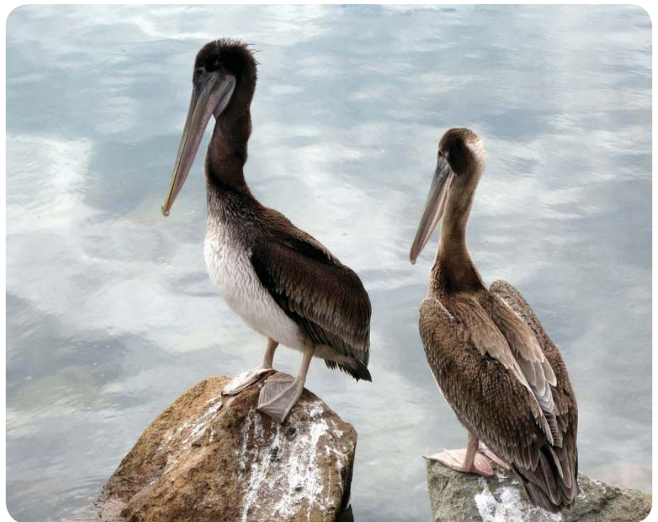
(both images) Brown Pelicans