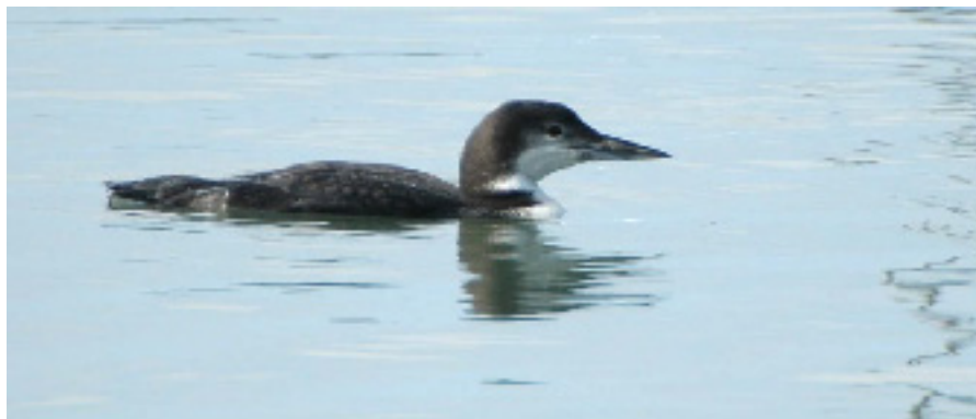
Wintering Common Loon, Morro Bay Harbor 1/22/05